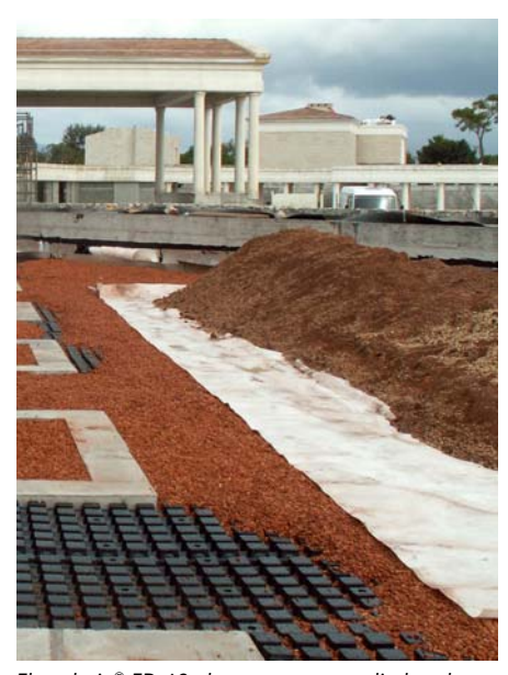
Floradrain® FD 60 elements were applied and infilled with Zincolit® Plus on this entire roof surface, also in the plant troughs which were meant for olive trees.