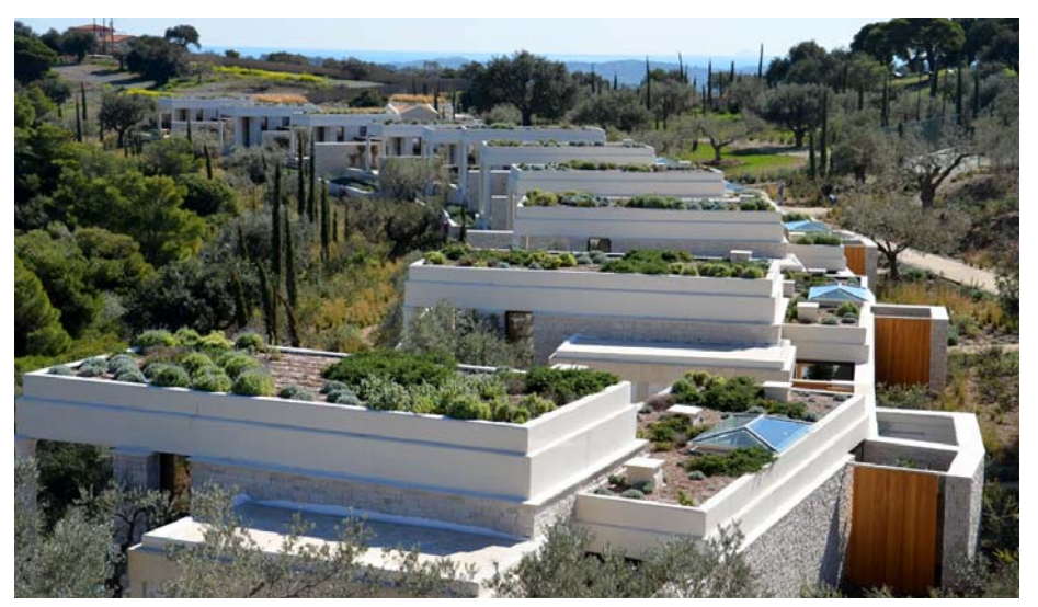
The green covered pavilions of the Amanzoe hotel complex harmoniously blend into the surroundings.