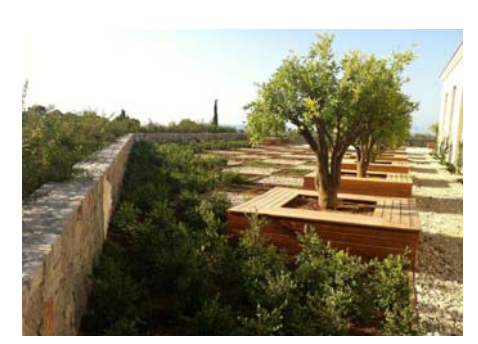
The room for root development of the olive trees was extended by special planting troughs.